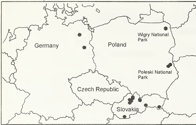
Fig. 1: Distribution of Emblyna brevidens in Poland and in countries adjacent to Poland.

Habitat study using Plant Habitat Indices (ELLENBERG et al. 1992, ZARZYCKI et al. 2002) was conducted on all islands and the mainland. In addition, habitat study was also carried out at the Lake Mamry archipelago (co-ordinates: 54°00'–54°10'N, 21°30'–21°52'E). The data were used to find islands on which E. brevidens seemed likely to exist.